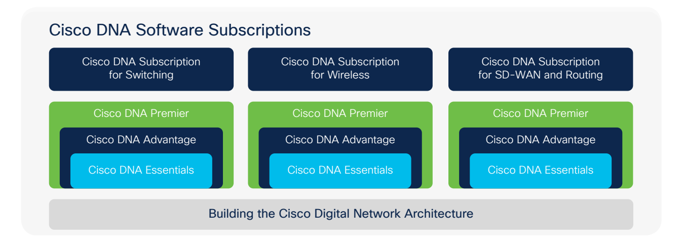
Figure 2. Cisco DNA Software Subscription Tier structure

In addition, only those customers that select the Cisco DNA Advantage and Premier tiers are eligible for Enterprise Agreements.